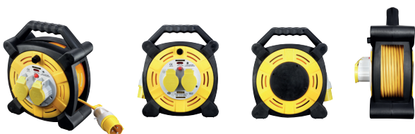
LVHLT x 16/2